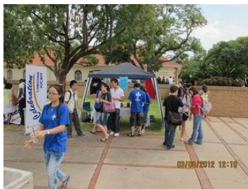
C2S2 sharing the Gospel and recruiting new members