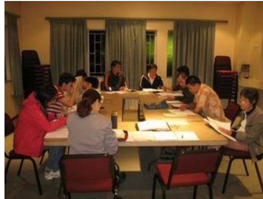
Combined Bible Study on Friday night