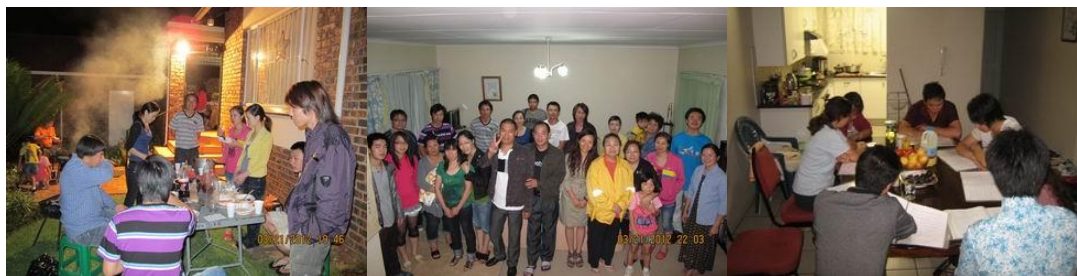
Pretoria Fuqing Wednesday Bible Study Group BBQ