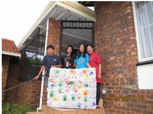
Handprints from ZWFC Children's Sunday School