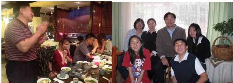
Whitney's mother's birthday party