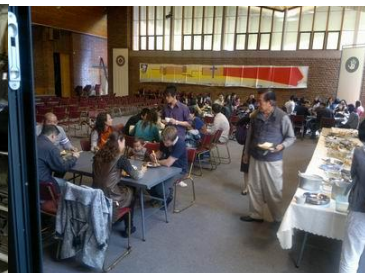
PECCC 16th Anniversary