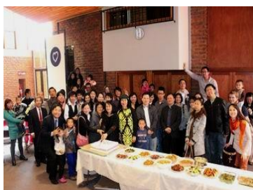
PECCC 16 th Anniversary