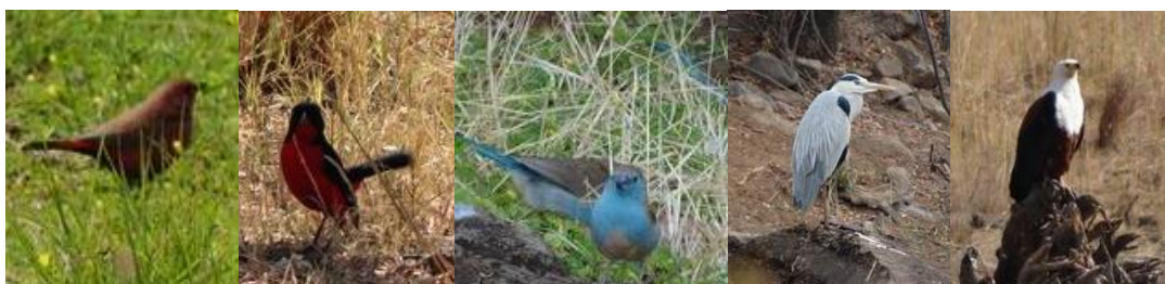
Awesome creation of God found at wild animal park