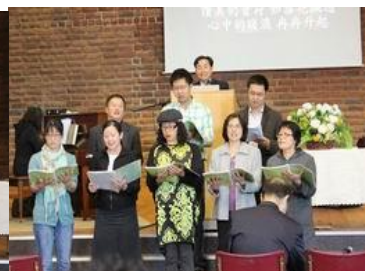
Offertory PECCC choir