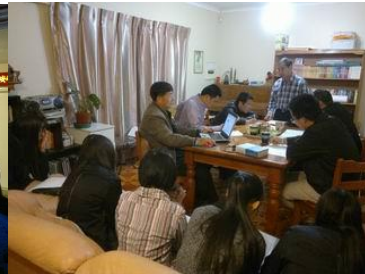
Training coworkers in Pretoria