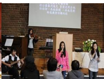
Offertory by PECCC College Students