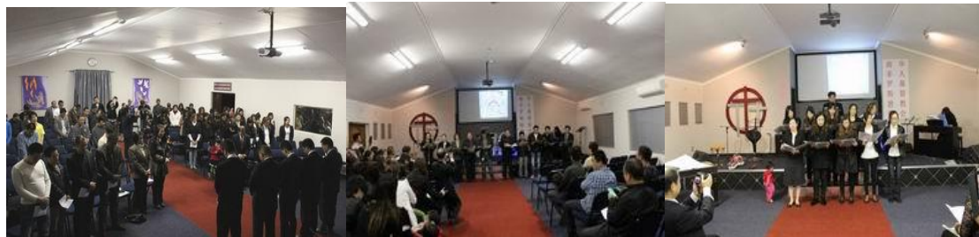
Dedication of Rustenburg Evangelical Chinese Christian Church /PECCC choir/Offertory from RECCC