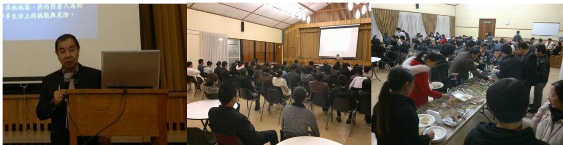
First anniversary thanksgiving dinner at PEFCCC