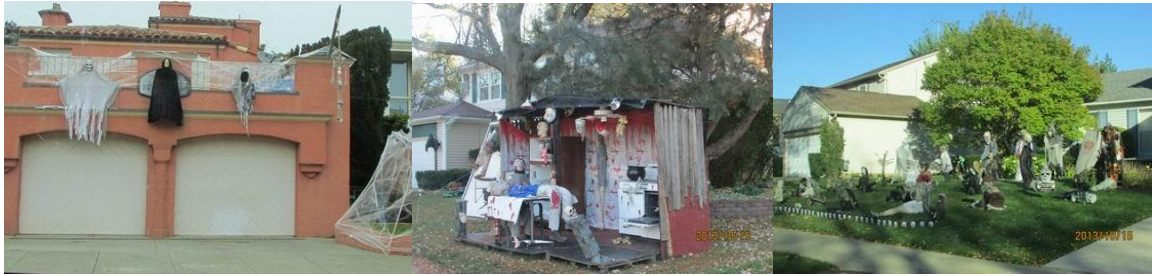
Ghostly Halloween decorations

Psalm 89:14 “Righteousness and justice are the foundation of your throne; love and faithfulness go before you.” Isaiah 28:16 “So this is what the Sovereign Lord says: “See, I lay a stone in Zion, a tested stone, a precious cornerstone for a sure foundation; the one who relies on it will never be stricken with panic.”