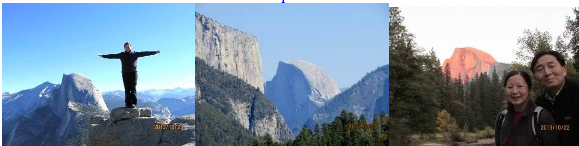
Yosemite National Park in California Yosemite's Half Dome at different time of day

Psalm 89:14 “Righteousness and justice are the foundation of your throne; love and faithfulness go before you.” Isaiah 28:16 “So this is what the Sovereign Lord says: “See, I lay a stone in Zion, a tested stone, a precious cornerstone for a sure foundation; the one who relies on it will never be stricken with panic.”