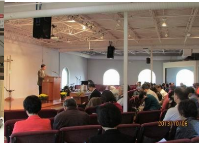
Preaching 2 Sunday sermons at CBCOP/ sharing with Christian leaders at CCLiFe in Chicago / Preaching at NLCC