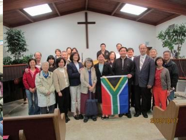
Hilltop Gospel Church