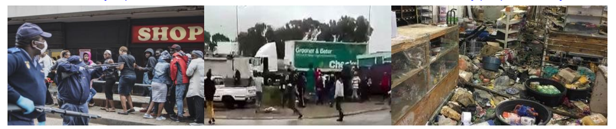
Many people say they have no masks