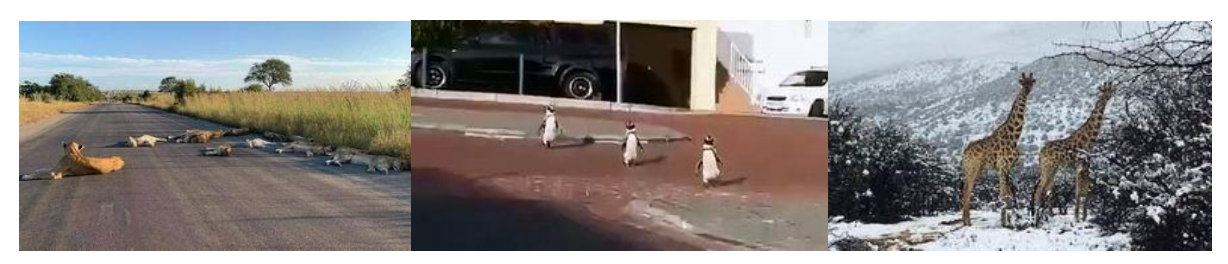
Lions in charge during the lockdown Penguins strolling in Cape Town Giraffes in the first snow of this year

A lot of brothers and sisters who are shop owners were indecisive on whether to pay the rent or pay workers' wages in April, because the government policy wasn't very clear. But God gave us peace in our hearts after prayers, and we understood that almost all businesses would need to wait until either the lockdown is lifted or until the policy is clarified, before any action is needed.