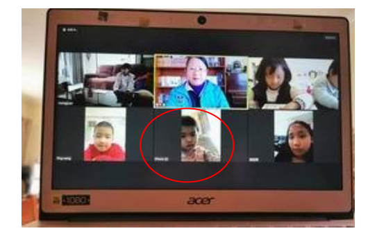
Virtual Choir hymn presentation for CCIC