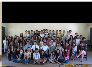
Group photo at 2011 Christmas Retreat