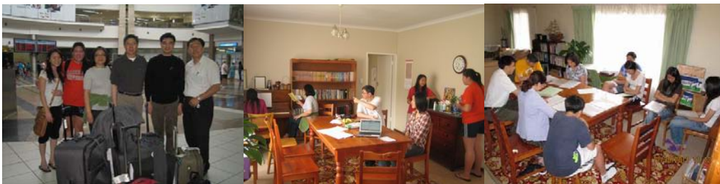
Chicago mission team arrived safely/Retreat preparations in our new home/Start the ministry with prayer